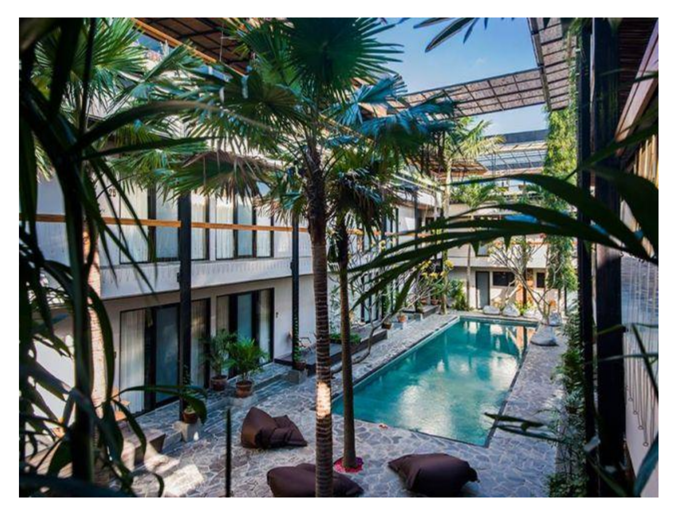
Yoga and conscious nutrition is a big draw-card and bonus of staying at The Shift. Affordable rates and classy design adds more to the experience

One of the best things about this address is strolling through the village to meet the friendly locals as they go about their rural work and religious devotion, giving you an authentic glimpse into the daily lives of the people who make this island so warm and welcoming. Weddings and events are a villa specialty, and with these 11 bedrooms, spacious gardens and two swimming pools, it's the perfect setting for any special occasion or holiday. Seseh Beach II Villas, Seseh Beach Canggu, Bali, p. +62 (0) 361 737498.