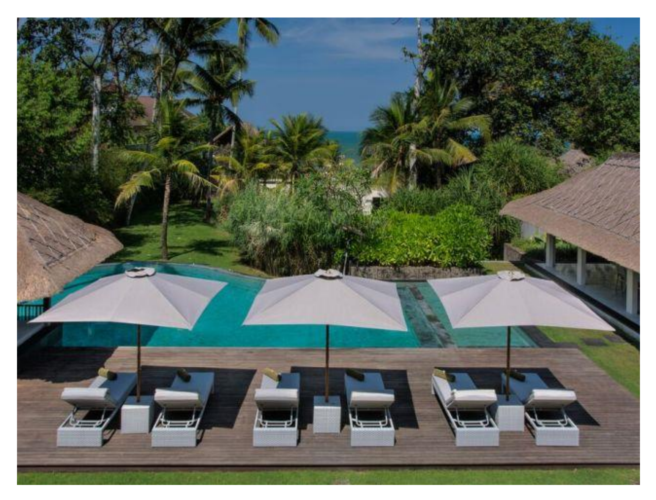
These luxe villas on Canggu's Seseh beach are designer and divine, in a relatively untouched area of Bali

This new hotel set-up is for surfers, friends or couples who want to escape the crowds and fancy restaurants, or catch some of Bali's best waves. Located right on Bingin Beach, it's prime real estate – and yes that also means dragging your bags and boards up and down all those Bingin steps, but it's worth it. With surfing & beach dining options right on your doorstep, venturing to nearby with Padang Padang, Uluwatu, Dreamland or Balangan is just even more of a good thing. The Sun & Surf Stay, Jalan Pantai Bingin, Bingin Pecatu, p. +62 (0)877 7054 5986.