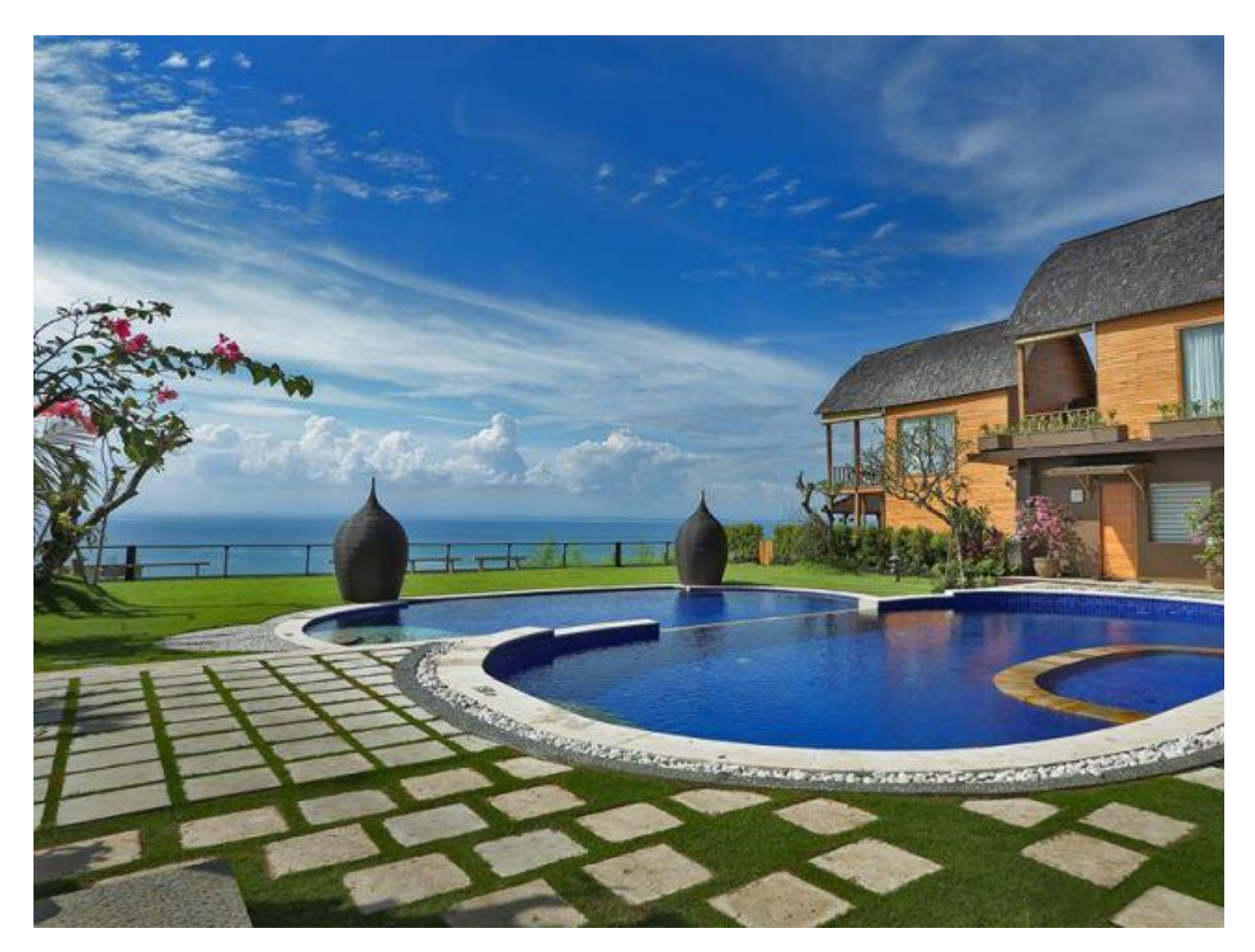
De Sapphire villas bring a affordable elegance and authenticity to Uluwatu

Alila Seminyak, Jalan Taman Ganesha No. 5, Petitenget, Seminyak, p. +62 (0) 361 3021 888.