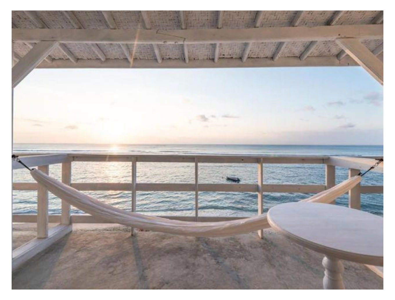
These views! Bingin is a touch of the old Bali – beachfront, local and now with affordable luxe and chic places to stay

Deluxe Villas feature a double-storey wooden house architecture, with private verandahs surrounded by spectacular views. The nine elegantly appointed single-storey villas are tastefully furnished with exquisite amenities, and the Suite Villas are set higher up to show off those breathtaking Indian Ocean views, with spacious balconies and areas to relax. So surfers and surfing widows alike can happily book in here for weeks on end, and both be entirely happy. De Sapphire, Jalan Pantai Suluban No 313, Kelurahan Pecatu, Uluwatu, p. +62 (0) 361 8498718.