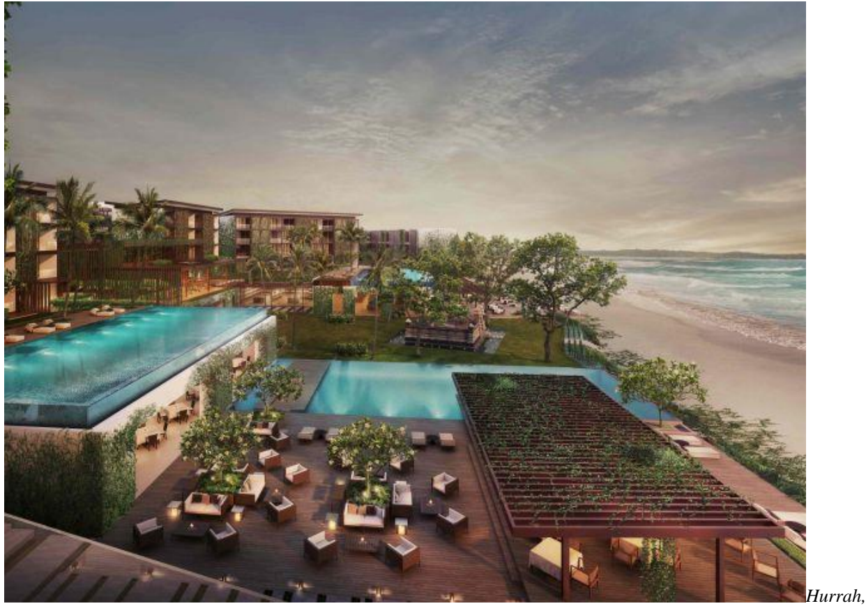
Alila Seminyak has opened their doors, pools, restaurants and elegant designer style to central Bali

From chic, sustainable bamboo-infused resorts overlooking Padang Padang, to five-star style with Alila Seminyak or the new, all-white beach stay at Bingin, Bali's hottest new addresses are worth checking out.... to check into on your next visit.