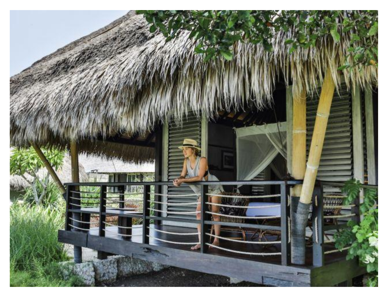
Warm, sensitive and sustainably designed, Suarga Padang Padang is modern luxury

Why? Because they each bring something <u>new</u>, <u>relevant and fabulous to the areas they've</u> <u>chosen</u> – and showcase some of Bali's most stunning and diverse areas to visit. So read on, drool away and <u>get the credit card</u> and calendar in sync... see you there!